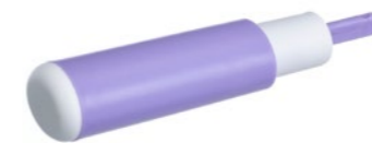
Lancelino Safety Lancet

The safety mechanism means that the blade/needle is hidden from view, allowing the blood collection to take place in a more relaxed atmosphere for all concerned.