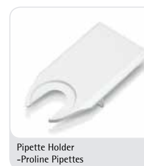
Pipette Holder -Proline Pipettes